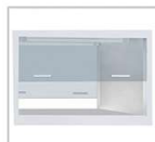
Double Sides Double sides work bench, operators can sit face to face