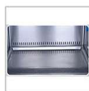
Work Zone Work zone, made of 304 stainless steel, is surrounded by negative pressure.