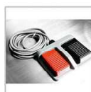
Foot Switch Adjust front window height by foot during experiment, to avoid airflow turbulence caused by arm movement.